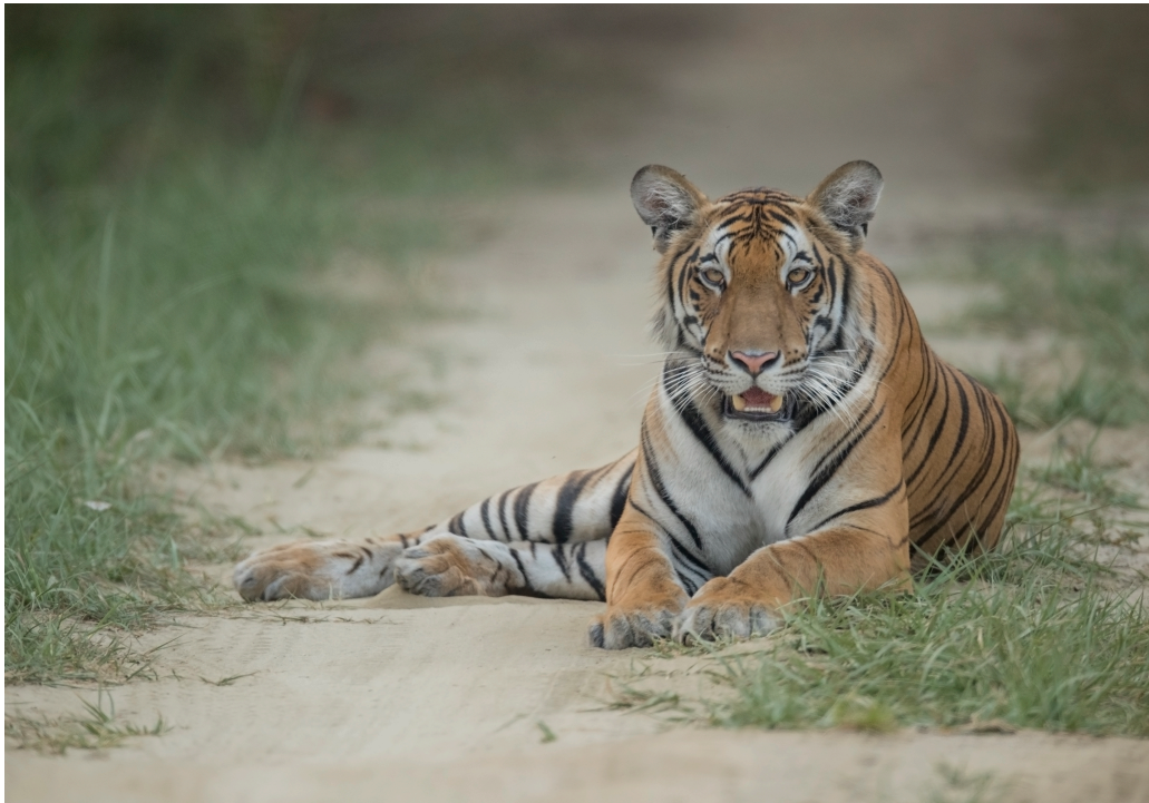
A famous tigress from Kishenpur Wildlife sanctuary, part of Dudhwa Tiger Reserve.