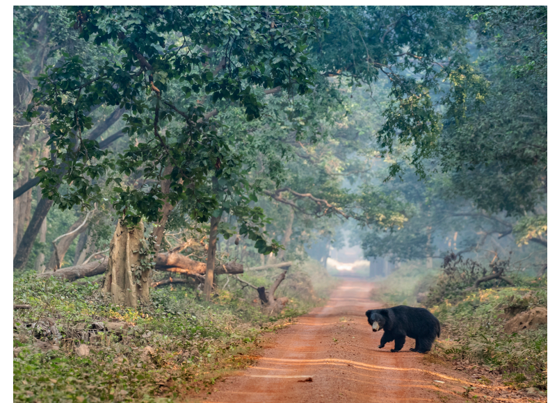
There is common sighting of Sloth bears!