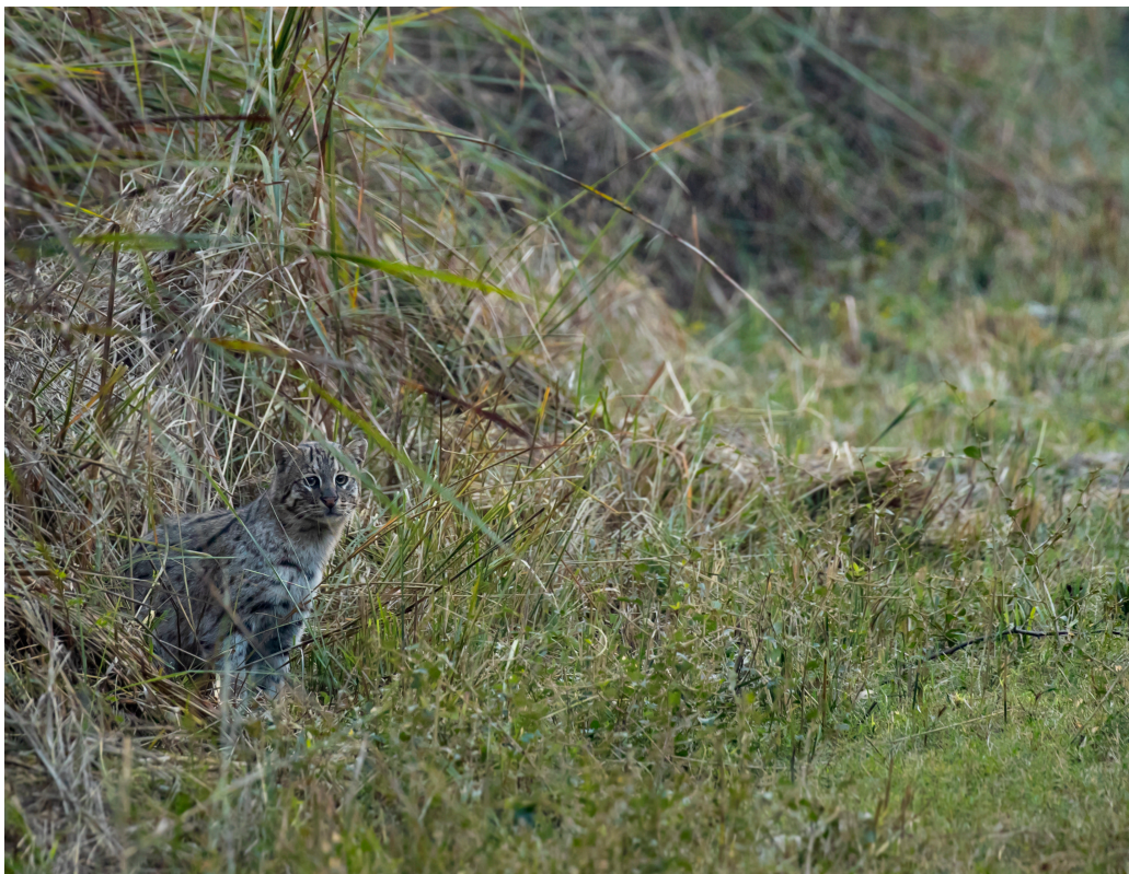
Fishing Cat from Dudhwa Tiger Reserve!

The landscape changes to thick trees, old trees, large trees, you know the jungle is not far and one's mood changes! There is still old world charm about this place! There is a large farming population and one starts seeing signs of farm houses! Tractor-trolleys and big trucks full of wood logs or sugarcane and one is reduced to a snail's pace or gets tested with one's patience! Keep a smile on your face and go with the flow.