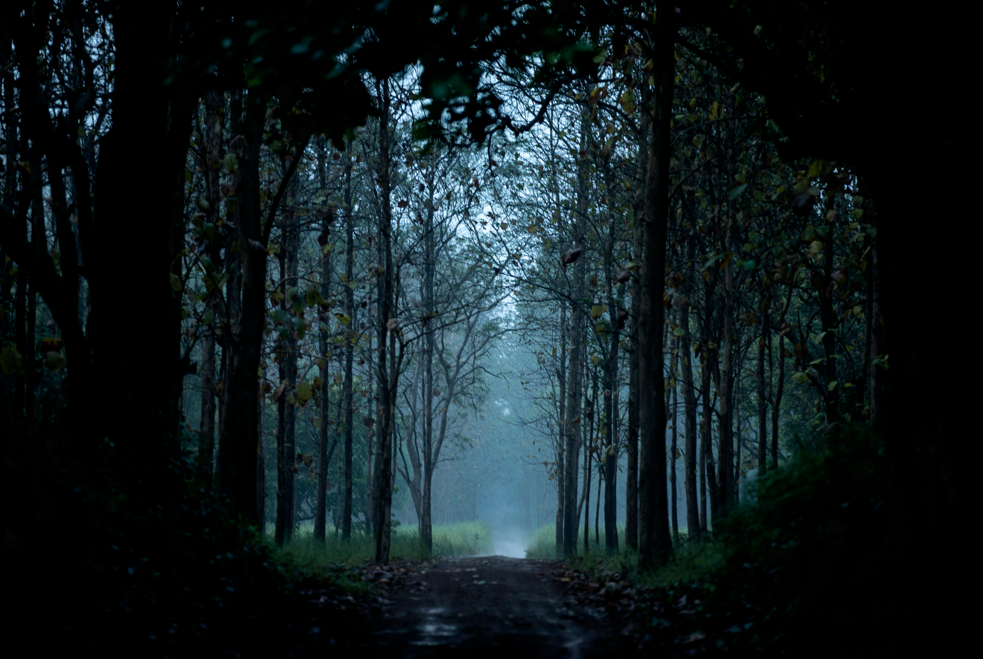
The forest turns magical with pre-monsoon showers!