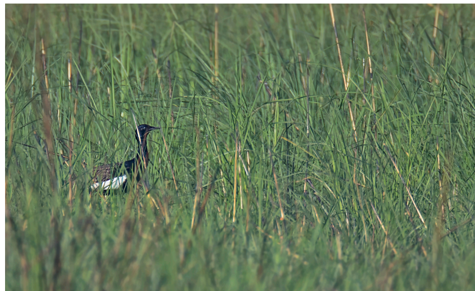
The rare Bengal Florican

Whether it is a spotlight of nature's theatre or dry feel of the summer heat to pre monsoon, the jungle is just overwhelming for a nature and wildlife lover! Images will come to you and pictures taken will be fresh in your mind when you go home! This jungle is grand!