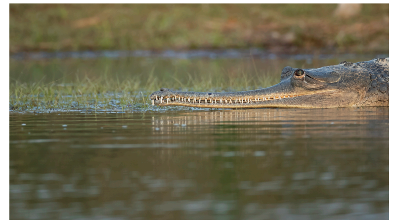
One of my favourites, Gharials!