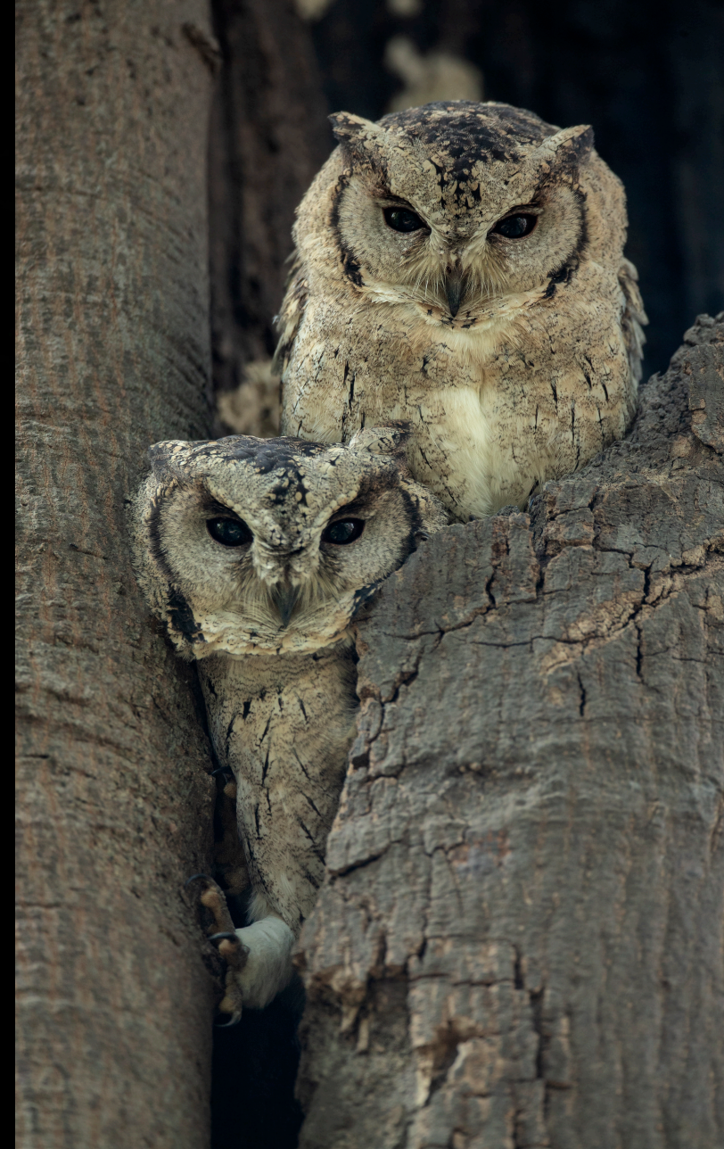
Asian Scops Owls