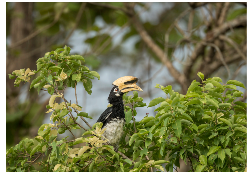
Pied Hornbill enjoying the onset of monsoon!

A week is not enough for me when I go, I need at least 10 days and we haven't even gone to Bardia National Park, the continuation of this park in to Nepal! That is a whole different story to be told soon!