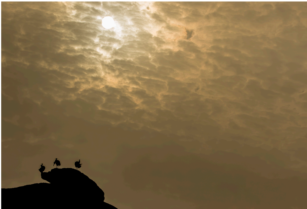
The peahens enjoy the morning gentle cool monsoon breeze and hoping for a good shower!

From the minute you leave the highway, the mood changes! Everything becomes slow paced! Soak it all in! One can slow down and enjoy everything that one lays eyes on! The rock formations first take over you! The awe that such dry and thorny land has so much farming and cattle amazes you! If one is naive, one wouldn't even think that most of the hills have leopards, hyenas, sloth bears, foxes and jackals! It is not like a regular sanctuary or a national park with a physical boundary but sprinkled within the farm lands and villages! Many times, you can see a Shepard and a Leopard on the same hill just metres apart!