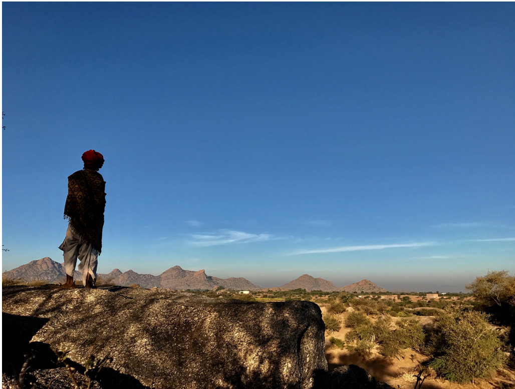
A local Rabari Shepard at peace with his panoramic view!